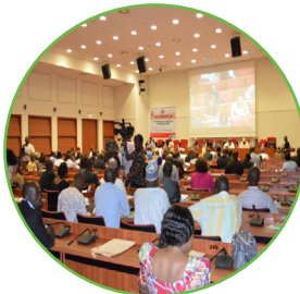
Public Enlightenment before Commencement of the Exercise