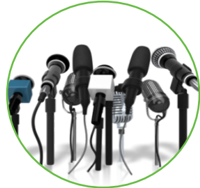
Sufficient Publicity for Public Hearings